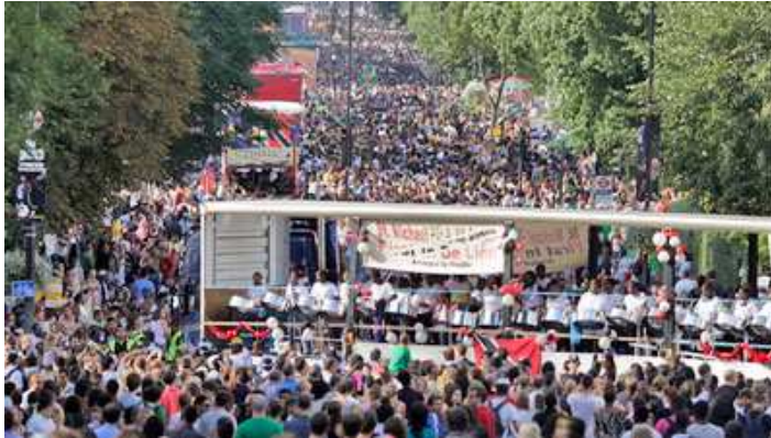
Notting Hill Carnival 2009