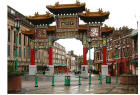
Imperial Arch, China Town, Liverpool

Indoor Media reaches up to 2.6 million unique users a month of which 200,000 are of South East Asian origin.