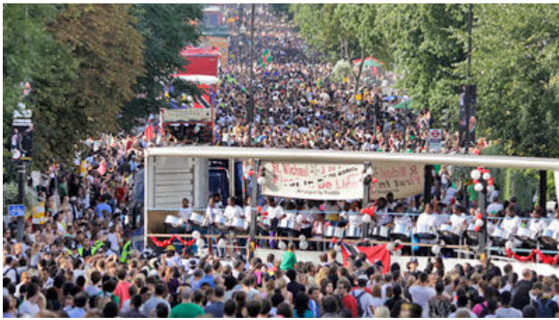
Notting Hill Carnival 2009

Over 2/3 ds of Black Africans agree that products that market to their culture influence their purchase